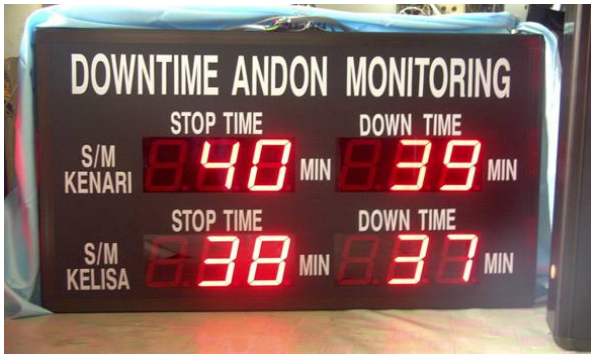
DOWN TIME ANDON